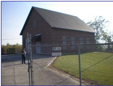
Booster Pump Station 514 is located at the intersection of Pecue Lane and Old Perkins Road.

This project includes the upgrade of booster pump station 514 (BPS514) to handle new flow and head requirements. The existing BPS514 has a capacity that is less than the predicted future peak wet weather flow.