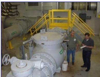
BPS514 will be converted from an in-line booster pump station to a wet well pump station.