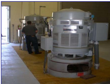
Looking inside BPS514, which will be upgraded from 24,000 GPM to 53,500 GPM to handle revised flow requirements.